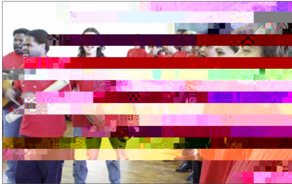
Performers with the Centre for Aboriginal Studies in Music.

the University's current programs and courses dealing with Indigenous topics. It would also conduct market research to determine demand and scope for Indigenous programs, develop links to local and national industries and the arts, and strengthen connections with Indigenous community groups.