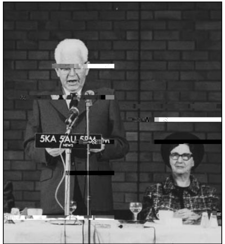
Then Governor of South Australia, Sir Mark Oliphant and Dame Roma Mitchell, then Deputy Chancellor of the University of Adelaide, at the official launching of Radio 5UV in 1972.