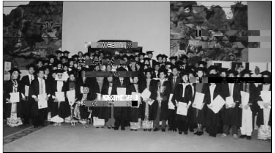
Graduates pose for their official photographs after the ceremony.