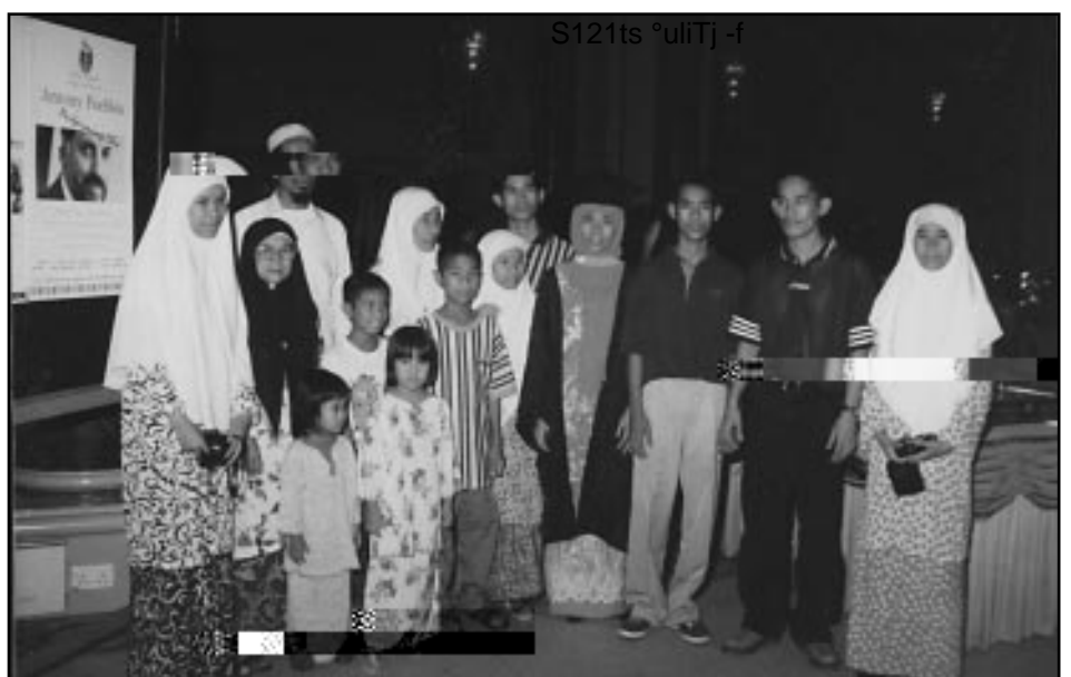
Graduation in Kuala Lumpur is an occasion for all the family. The above photographs by William Abraham of Charlie's Photography, Klang.